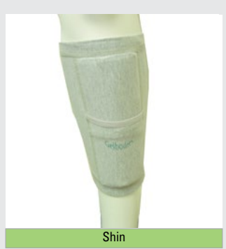
Measure around calf.