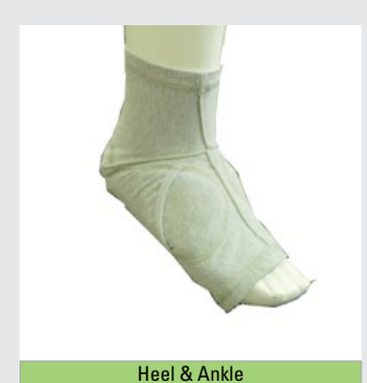
Measure around ankle, just above the ankle bone.