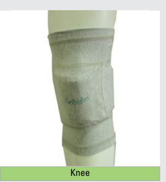
Measure around knee.